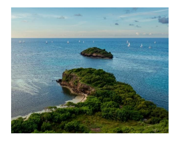
The fleet of racers during the Round Grenada Regatta

Prizegivings on both days were a rousing success, with great photos from Arthur Daniels Creative throughout the event.